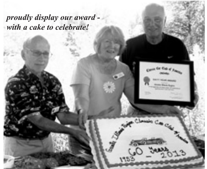
proudly display our award - with a cake to celebrate!