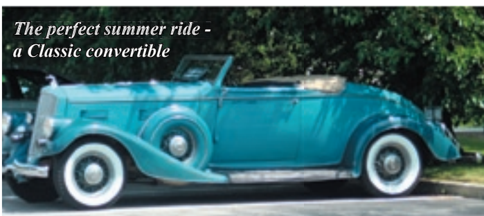
The perfect summer ride - a Classic convertible