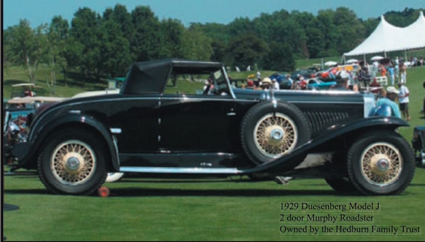
1929 Duesenberg Model J 2 door Murphy Roadster Owned by the Hedburn Family Trust