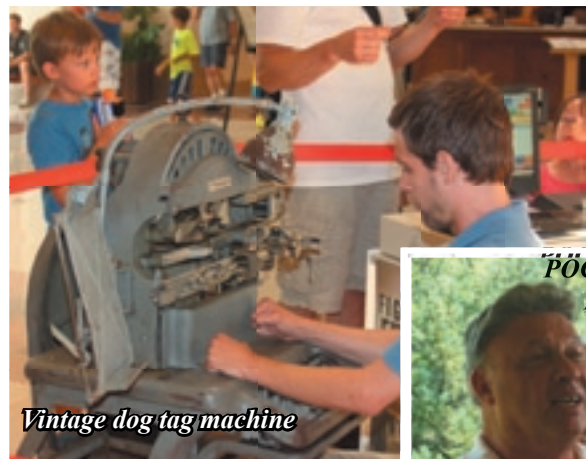
Vintage dog tag machine