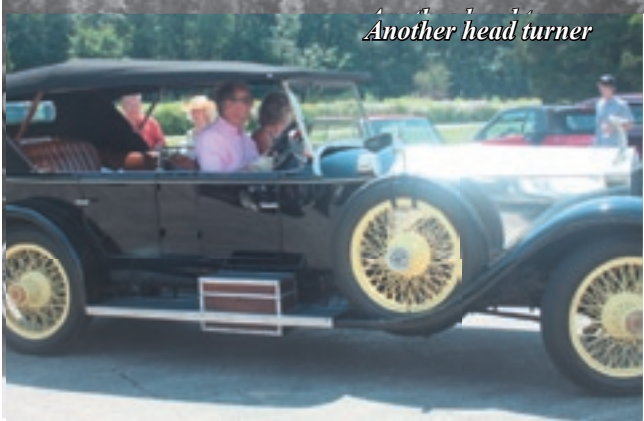
Another head turner