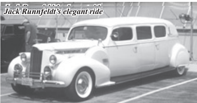
Jack Runnfeldt's elegant ride